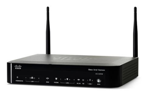
Figure 1. Cisco Unified Communications 320W